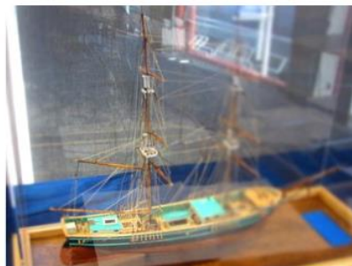
Ralph Buckwalter’s Volute won a Silver